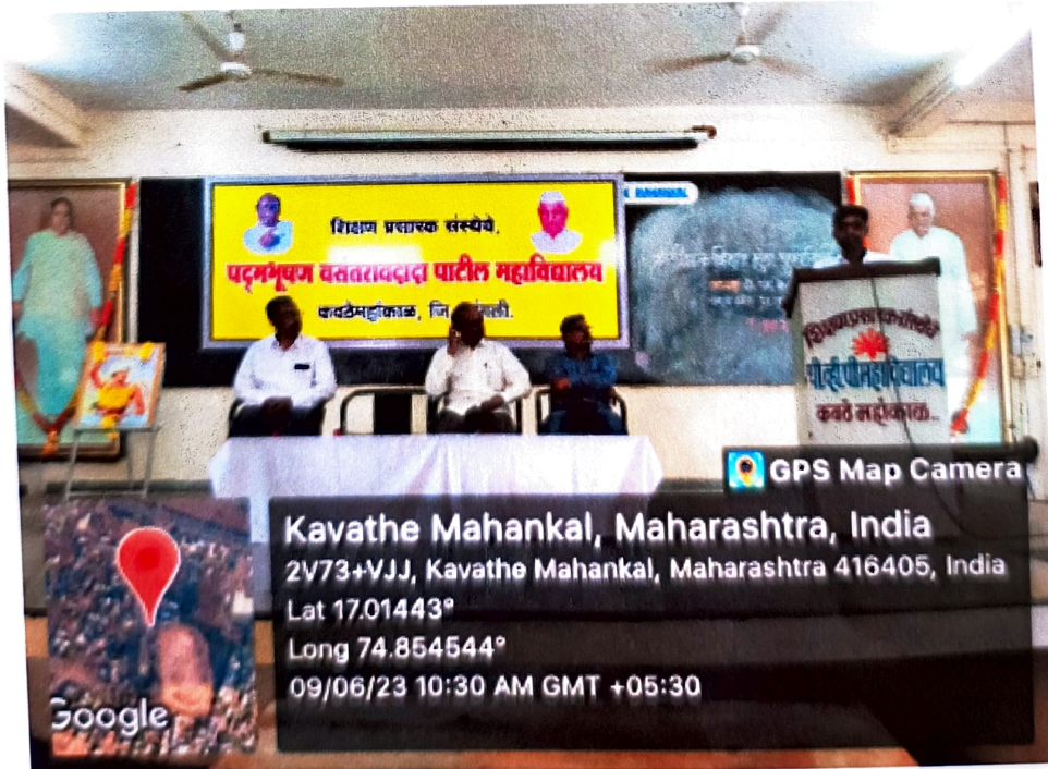
Birsa Munda Death Anniversary